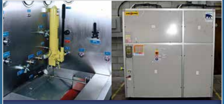
Test cabinet assembly (Left), Hydraulic pressure power unit. (Right)