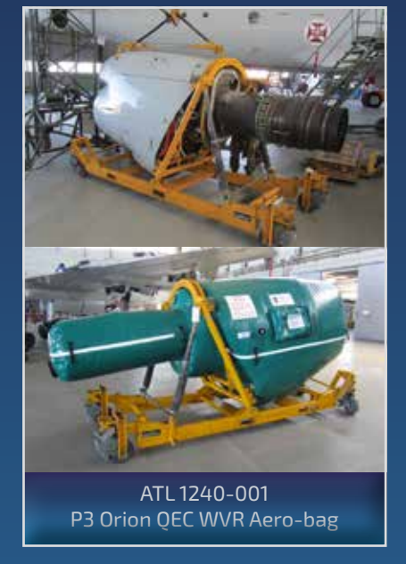
The WVR Aero-bag has been designed and developed based upon the same technology used for the ATL1175-001 C-130J WVR Aero-bag which was tested and approved by Lockheed Martin Aeronautics Inc, Marietta, Georgia. This product has consequently been identified as the preferred design for all future QECU preservation, storage and transportation standards.