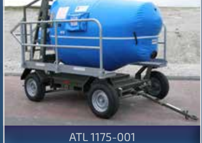
C-130J QEC WVR Aero-bag