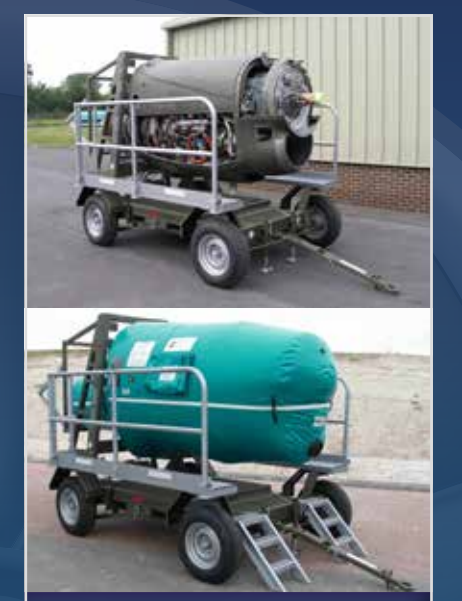
ATL 1105-001 C130H QEC WVR Aero-bag

For the Lockheed Martin C-130E to H & C-130J Hercules Aircraft QECU's